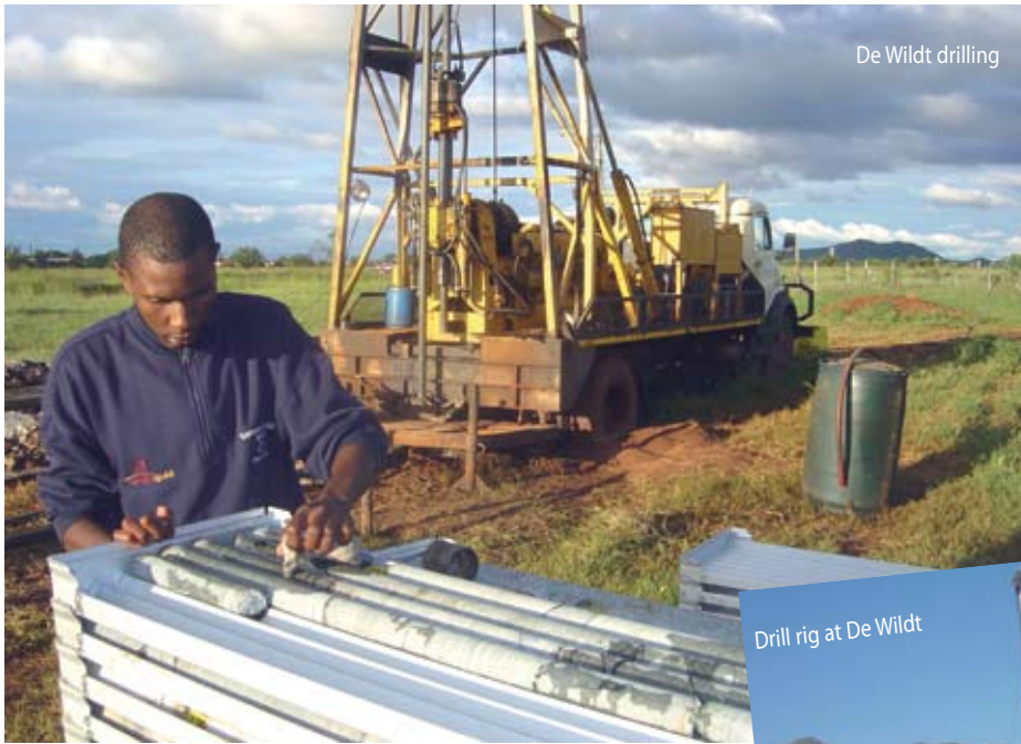
De Wildt drilling