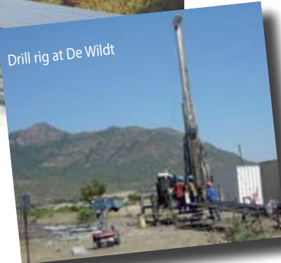
Drill rig at De Wildt